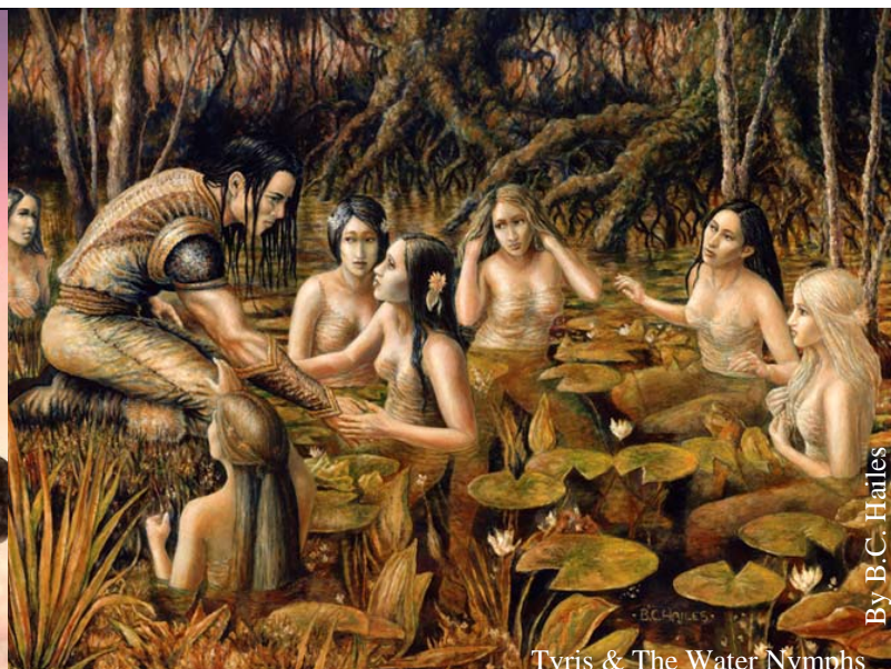
Tyris & The Water Nymphs