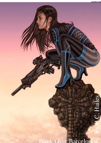
Blink Over Barcelona